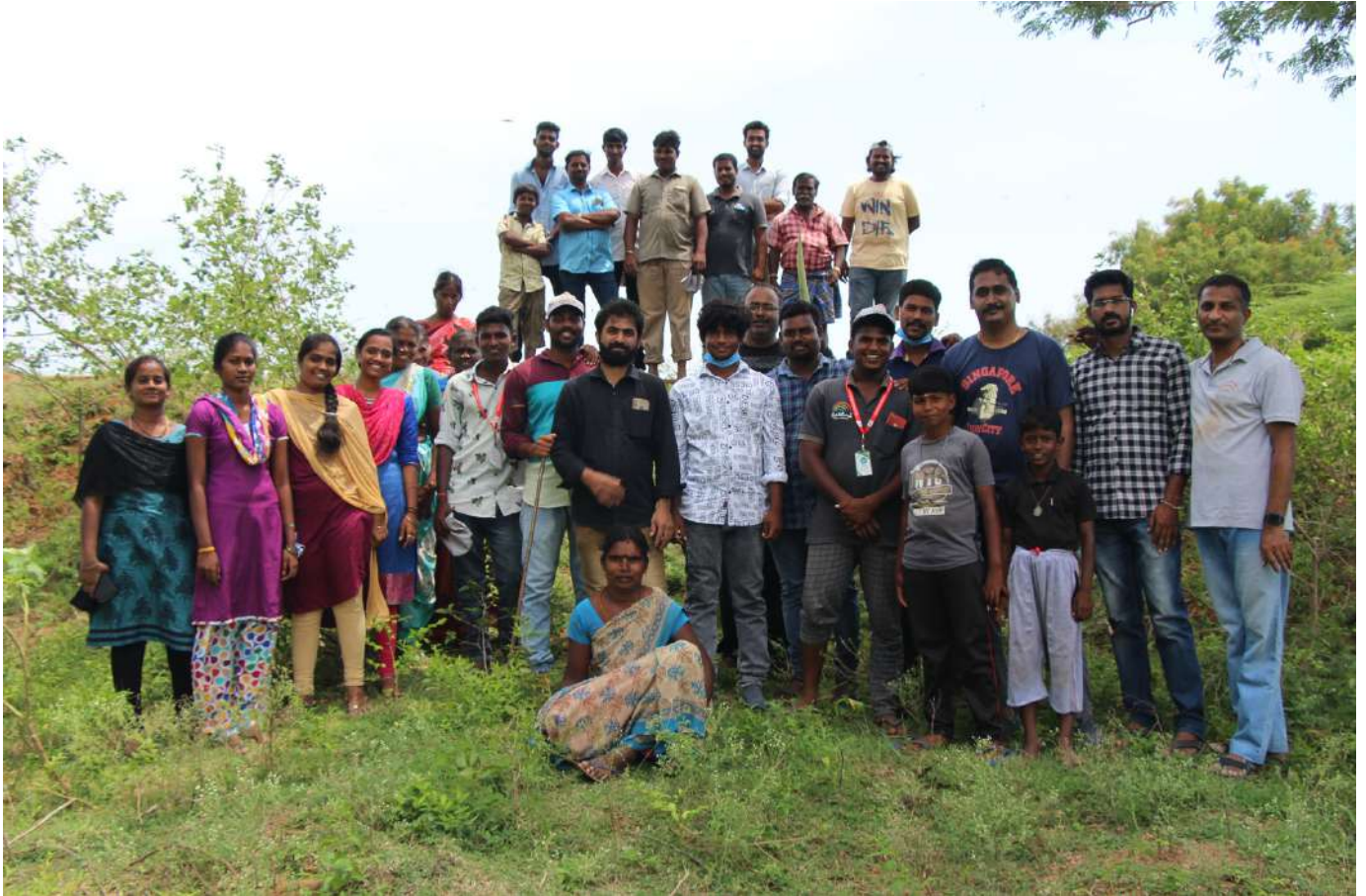
Regenboog India Foundation - Team and Volunteers

We thank you for your continued support in our efforts to provide education for all