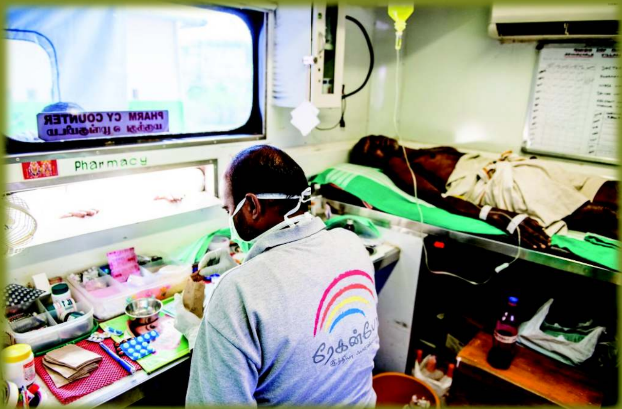
Mobile Clinic at work...

The Mobile Clinic was created to offer basic healthcare facilities to the people living in the rural remote villages where medical facilities do not exist. The Mobile Clinic completed its 5 th year of service and it crossed the major milestone of providing 252,000 treatments since it started.