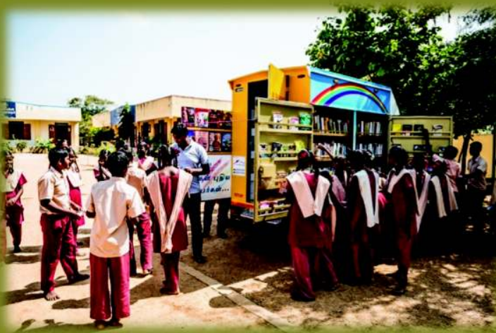
Government school students with Mobile Library