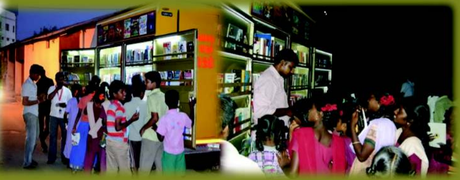
Mobile library at work