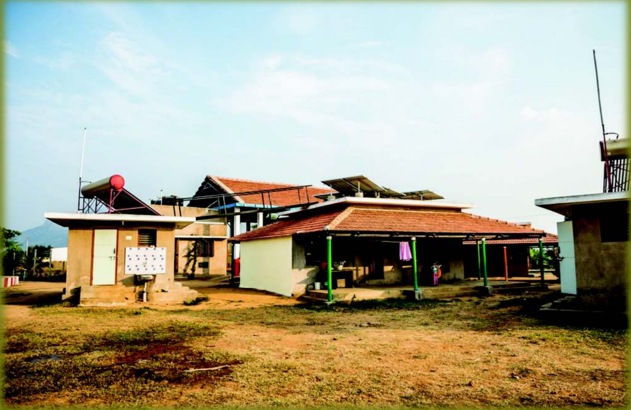
Children's Village Campus