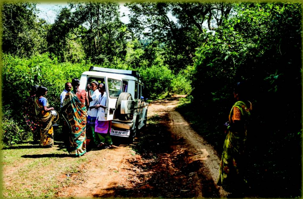
Mobile Clinic team at Jawadhu Hills (They visit Jawadhu Hills with the Jeep)

The Mobile Clinic traveled 15,574 km this year to provide treatments and bring smiles!