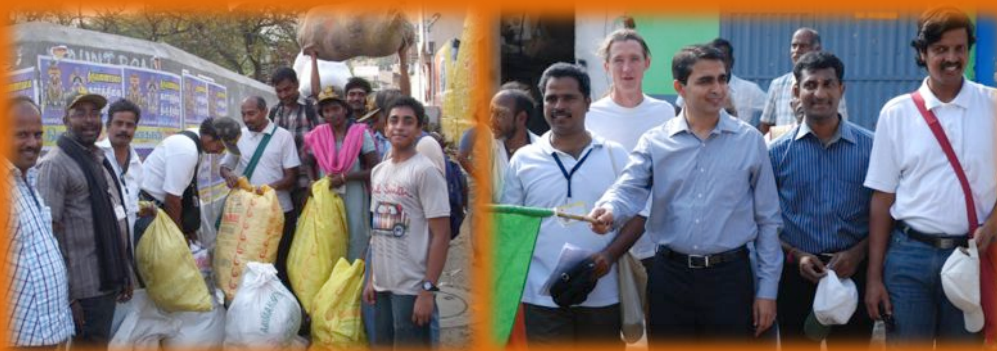
Plastic and flammable materials collected on the hill during Deepam day

In 2012-13, our team was involved actively in the environment awareness and protection works along with The Forest Way, a charity organization that works for the environmental issues in Chennai and Tiruvannamalai. Mainly we have been involved in fire fighting on the Arunachala hill together with the volunteers and Forest Department of Tamilnadu Government. We used our local resources for this program. Also, the team joined in cleaning the trash left on the hill and provided protection work during the Deepam festival (collecting matches, lighters, camphor etc.).