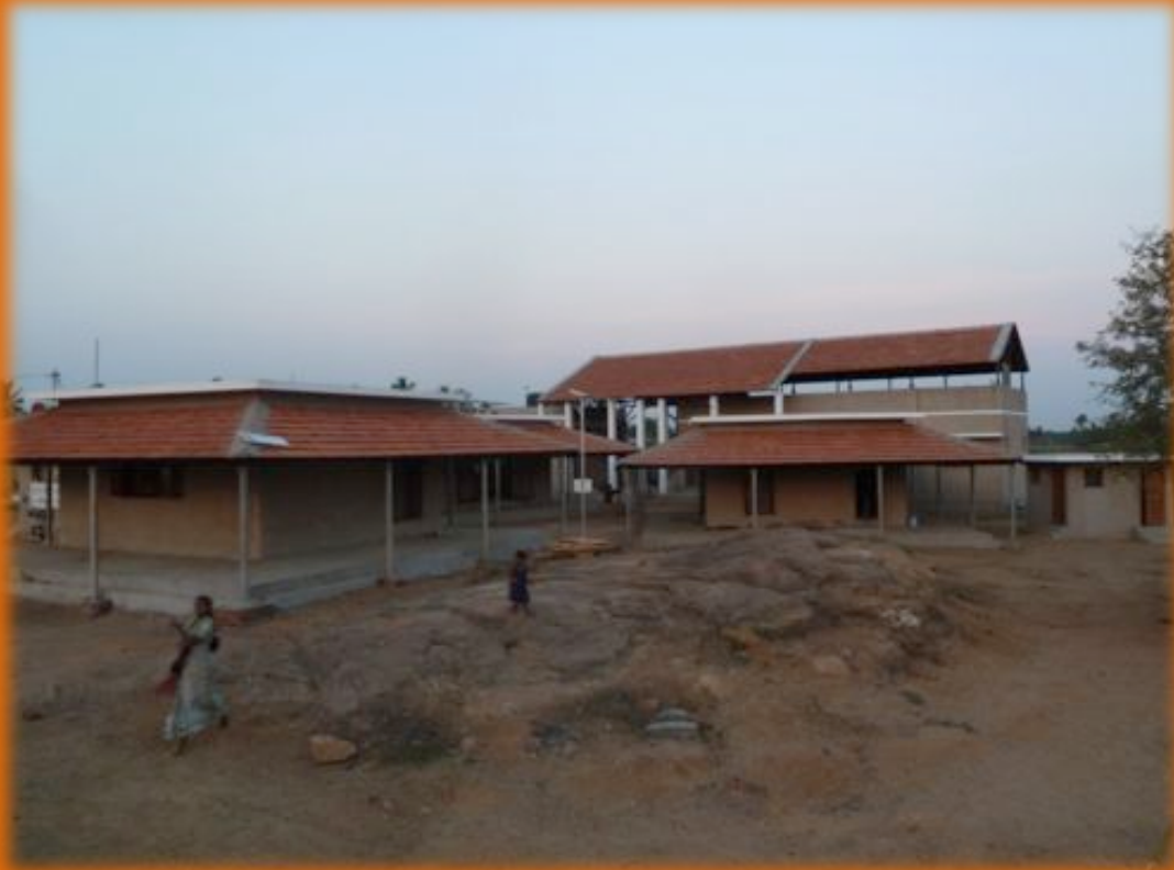
View of Children's Village

In the children's village campus there are three family/houses named after flowers chosen by the children - Hibiscus, Lotus and Glory Lily (Senganthal). Each family houses 11 children, one housemother, and one sister or aunt. So there are three families living in the Children's Village.